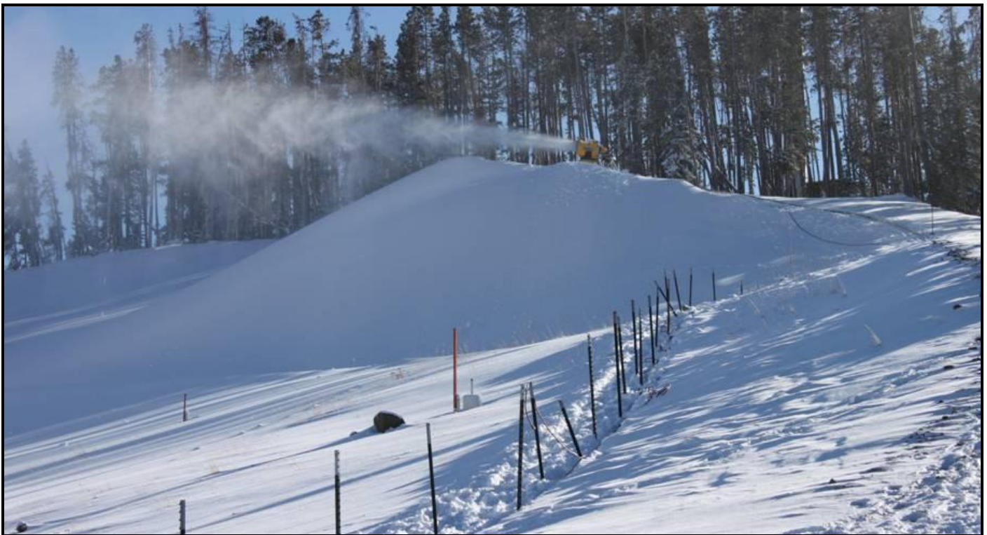
Looking south at the snow pile.