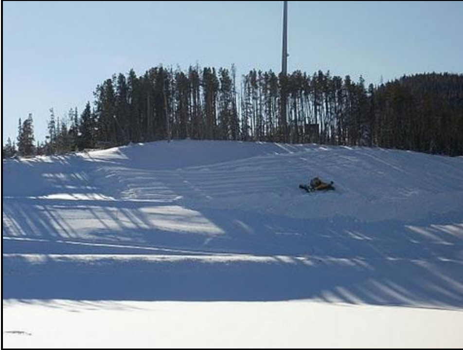
Looking south as a snowcat pushes the snow pile over the site.

All snowmaking operations have been completed and the snow gun has been moved offsite. We have taken 3 rounds of snowpack samples so far and will be taking a 4 next week. The Big Sky Weekly did a nice story on the project. I also put together 2 web albums that show more pictures of the projects. The article and albums can be found at the links below.