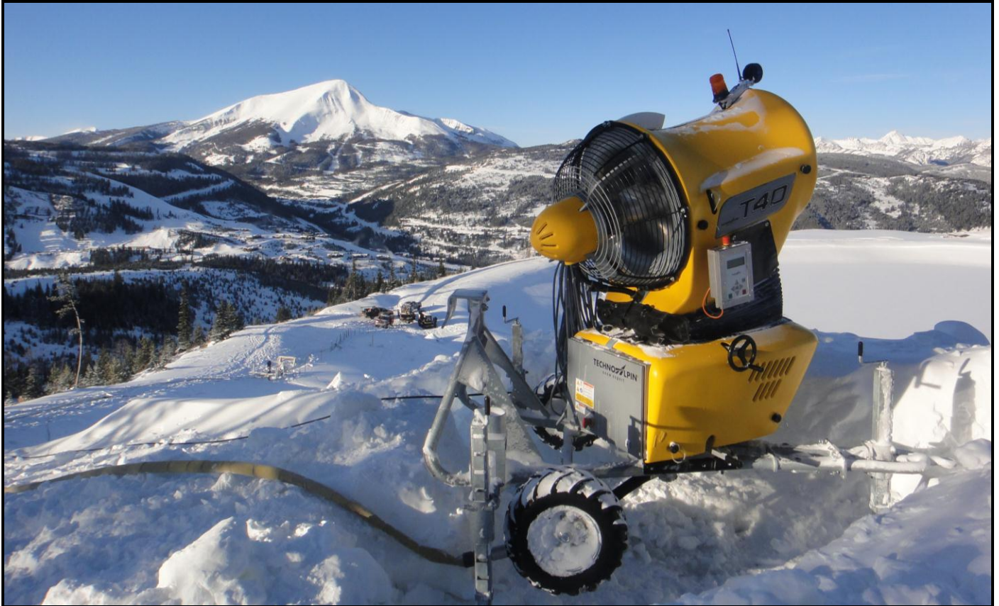
Snowmaking gun on top of the pilot site looking toward Lone Peak.